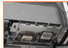
Staggered Dual Print Heads