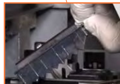
Replaceable Print Wiper